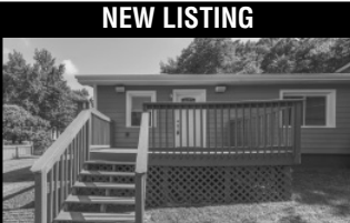
NEW LISTING 132 Bixby Court, Kirkwood 2 bed/1 bath, updated, solar Panels, Why pay rent? $165,000 • Dana Link