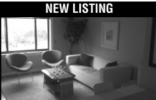
NEW LISTING 702 Argonne Ave, #5, Midtown 2 bed/1 bath Charming Pied-a-terre At Melrose Park, hardwoods, garden view $148,900 • Norman Bruce