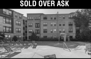
SOLD OVER ASK 821 Ralph McGill Blvd #3112 1 bed/1 bath, total renovation! Beautiful new kitchen, bath and floors $179,900 • Mike and Margie