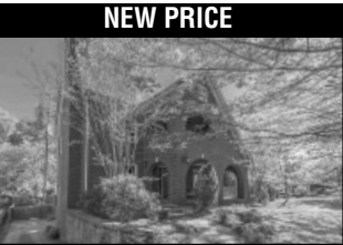
NEW PRICE 1152 Spring Valley Lane, Morningside 5 bed/5 bath, Amazing Newer build Huge master suite with porch, walkable $1,174,000 • Cam McCaa

Atlanta Intown Real Estate Services celebrates its 20th year of helping buyers and sellers in Kirkwood and the other vibrant intown neighborhoods of Atlanta. We've been here through up and down markets and are still proud to be, locally owned, neighborhood based, and client focused! Whether you are moving in, moving out, or moving right around the corner, let us help you with your next smart move!