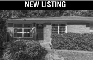
NEW LISTING 1253 Tacoma Way, Belvedere 3 bed/1 bath renovated mid- Century ranch with family room $139,000 • Meredith Miller