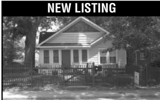
NEW LISTING 1380 Glenwood Ave, East Atlanta 3 bed/2 bath, bungalow duplex, with 1/1 In terrace level. Walkable to Village $299,000 • Kirk Surgeon