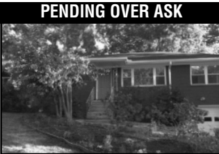
PENDING OVER ASK 1293 Poplarcrest Circle, East Atlanta 3 bed/2 bath, Renovated ranch Great kitchen, new roof, paint, etc Under $299,900 • David Vannort