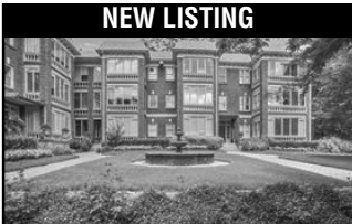
NEW LISTING 272 14th st #17, Midtown 1 bed, 1 bath, historic charm on Piedmont Park at Park View $229,900 • David Vannort