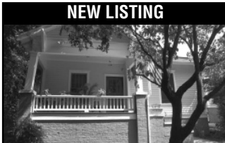
NEW LISTING 303 Nelms Ave, Lake Claire 3 bed, 1.5 bath fixer upper, large Family room, adjoins the Land Trust $430,000 • Chris Carroll