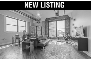
NEW LISTING 87 Peachtree St, #409, Downtown 1 bed/1 bath, Kessler City Lofts, Spacious Bright, historic building with parking $139,900 • Kirk Surgeon