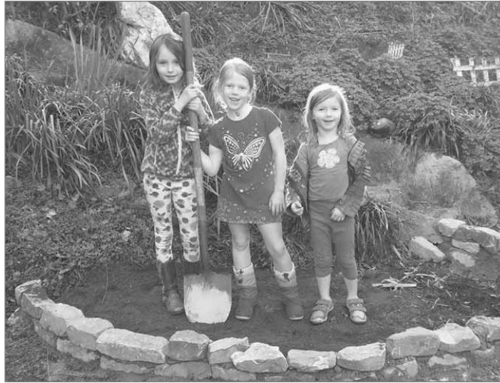
Miss Ladybug welcomes your children's involvement to shape the look, feel, and future programming at the garden.

serves as an interactive space to grow, learn, and create art. For example, during the week of June 26-30, participants in the first Garden Theater Camp will