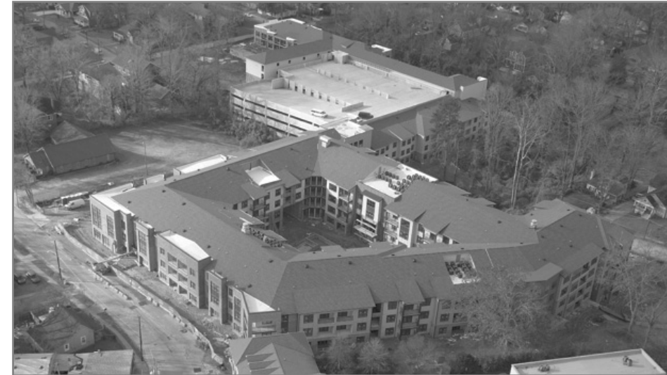
photo by Aerial Photography, Inc. (Jan. 13, 2018), courtesy Walton Construction Services

The Kirkwood, a mid-rise wrap apartment complex with 232 units in the heart of the Kirkwood village, is slated to open May 2018. It will have 15 spacious one- and two-bedroom floorplans, averaging 1,042 square feet.