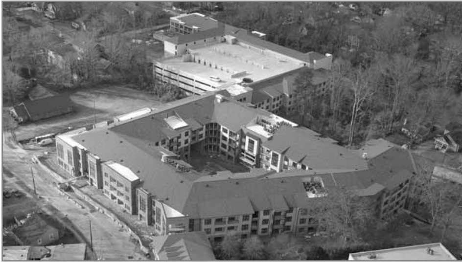
photo by Aerial Photography, Inc. (Jan. 13, 2018), courtesy Walton Construction Services

The Kirkwood, a mid-rise wrap apartment complex with 232 units in the heart of the Kirkwood village, is slated to open May 2018. It will have 15 spacious one- and two-bedroom floorplans, averaging 1,042 square feet.